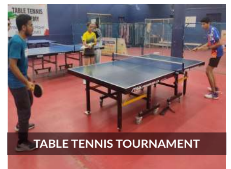
TABLE TENNIS TOURNAMENT