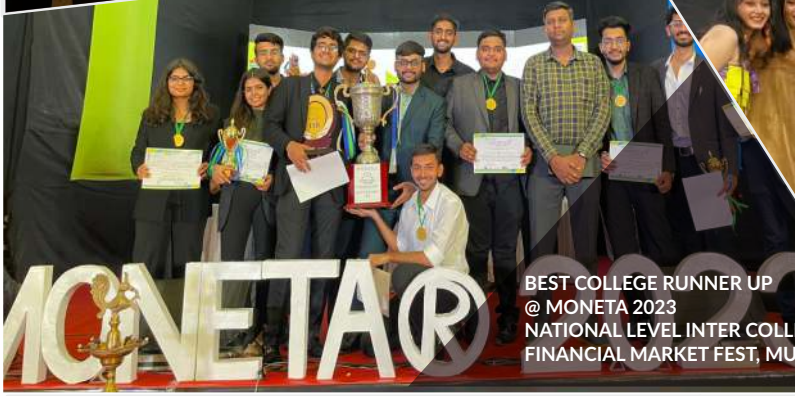
BEST COLLEGE RUNNER UP @ MONETA 2023 NATIONAL LEVEL INTER COLLEGIATE FINANCIAL MARKET FEST, MUMBAI