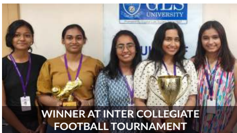
WINNER AT INTER COLLEGIATE FOOTBALL TOURNAMENT