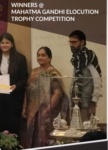
WINNERS @ MAHATMA GANDHI ELOCUTION TROPHY COMPETITION