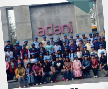
FIELD TRIP TO MUNDRA PORT