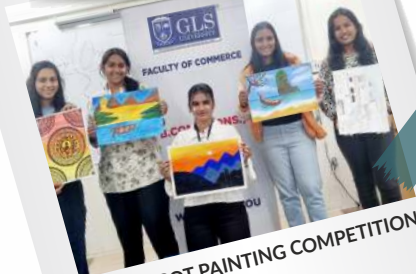
ON THE SPOT PAINTING COMPETITION