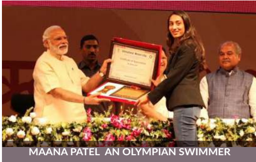
MAANA PATEL AN OLYMPIAN SWIMMER