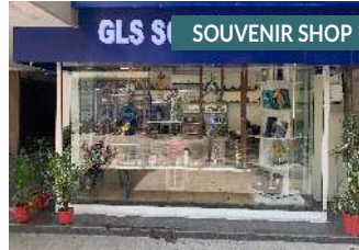
GLS S U SOUVENIR SHOP