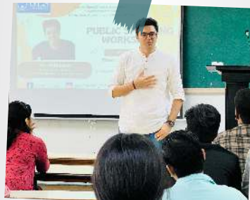
PUBLIC SPEAKING WORKSHOP