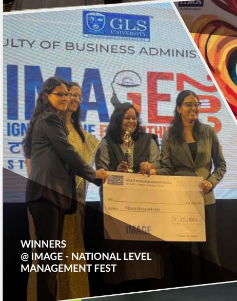
WINNERS @ IMAGE - NATIONAL LEVEL MANAGEMENT FEST