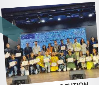
MANTHAN ELOCUTION COMPETITION