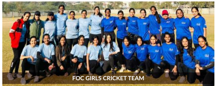
FOC GIRLS CRICKET TEAM