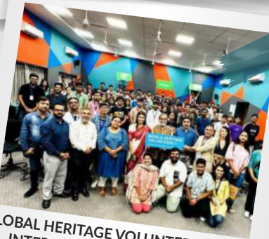
GLOBAL HERITAGE VOLUNTEERS INTERACTION PROGRAM