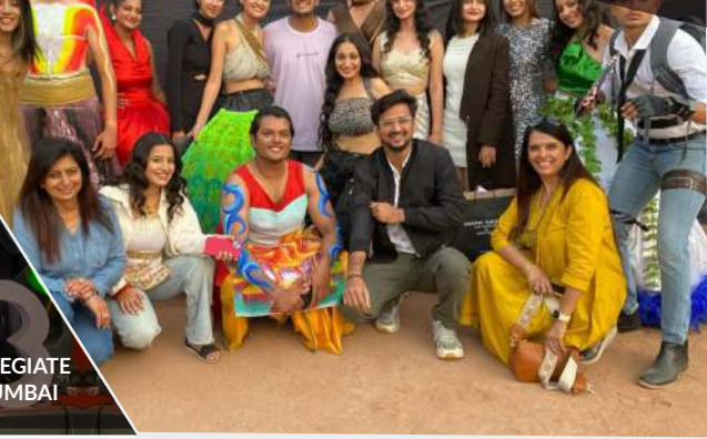
WINNER IN FASHION SHOW @ IIM-A CHAOS 2024