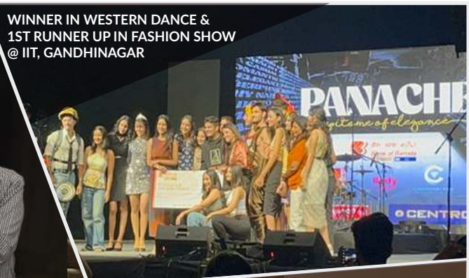
WINNER IN WESTERN DANCE & 1ST RUNNER UP IN FASHION SHOW @ IIT, GANDHINAGAR