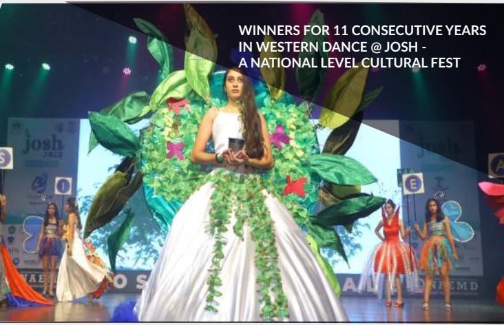
WINNERS FOR 11 CONSECUTIVE YEARS IN WESTERN DANCE @ JOSH - A NATIONAL LEVEL CULTURAL FEST