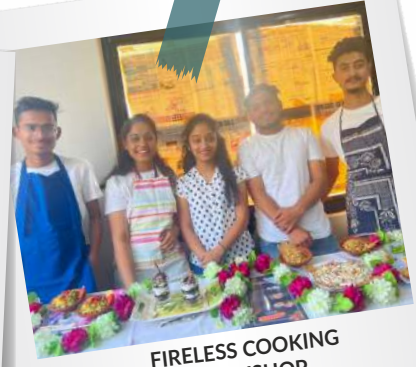
FIRELESS COOKING WORKSHOP