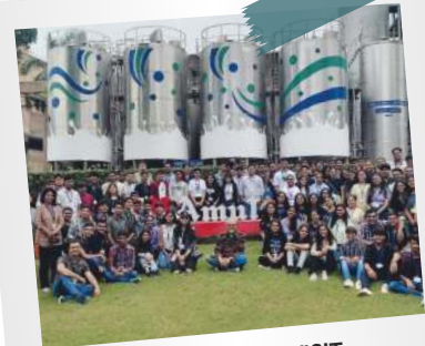
INDUSTRIAL VISIT TO AMUL