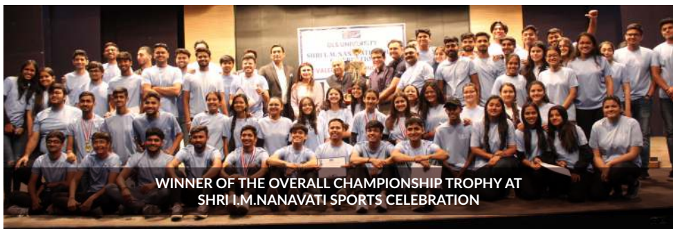
WINNER OF THE OVERALL CHAMPIONSHIP TROPHY AT SHRI I.M.NANAVATI SPORTS CELEBRATION