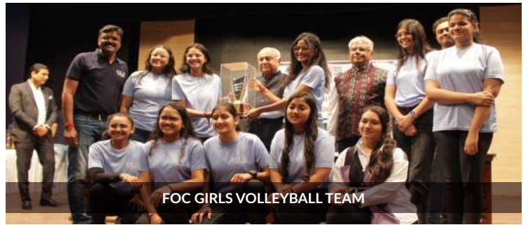
FOC GIRLS VOLLEYBALL TEAM

Faculty of Commerce provides excellent Sports infrastructure, well-equipped Gymnasium for fitness and Training facilities for the sports like Cricket, Volleyball, Basketball, Football, Kabaddi, Chess, Carrom, Table-Tennis, Badminton and Athletics resulting to several students shining at various sports tournaments at University, National and International level Championships.