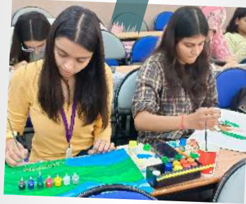
FINE ARTS WORKSHOP