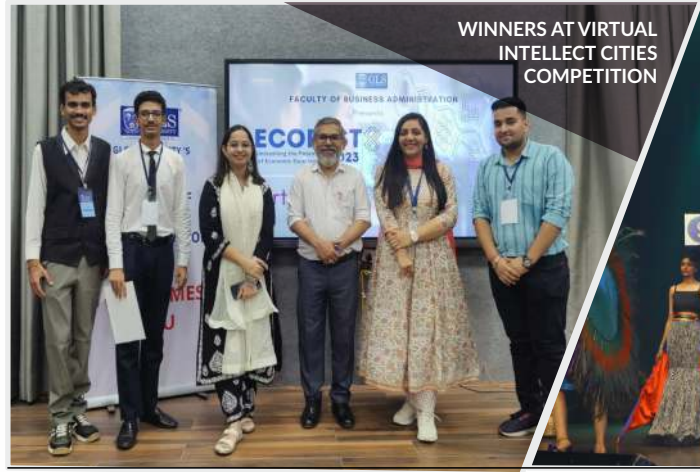
WINNERS AT VIRTUAL INTELLECT CITIES COMPETITION