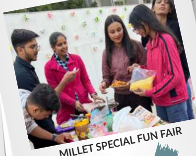
MILLET SPECIAL FUN FAIR