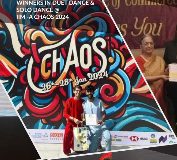
WINNERS IN DUET DANCE & SOLO DANCE @ IIM - A CHAOS 2024